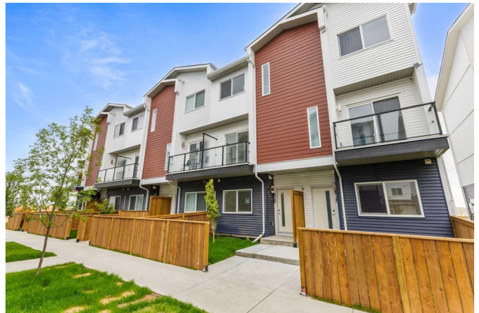
628 Red Sky Villas NE, Calgary, AB

Modern comfort, flexible living, and a convenient location—this move-in-ready home has it all. Book your showing today!