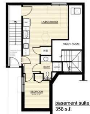
basement suite: 358 s.f.